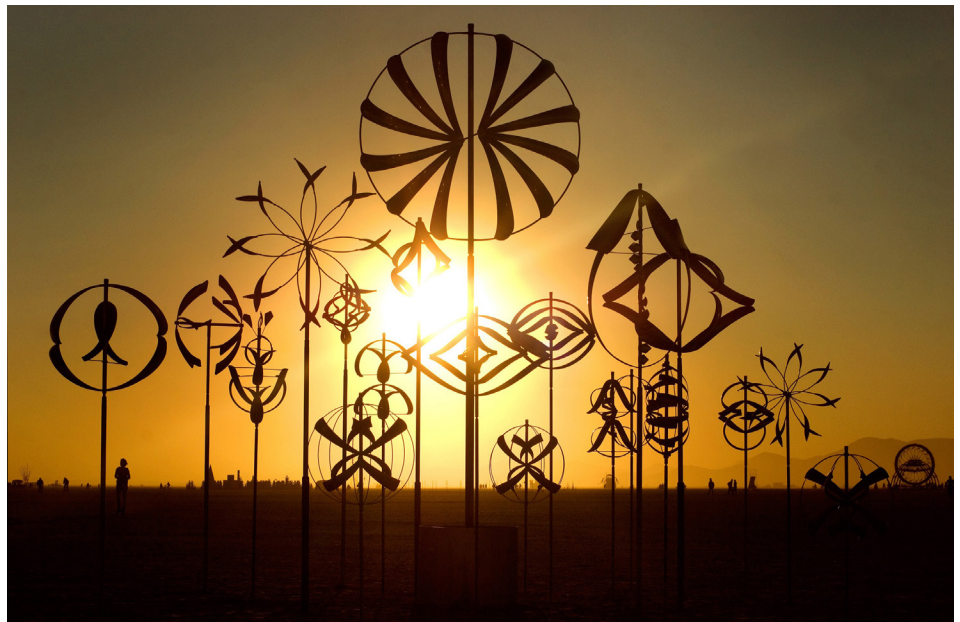
Kinetic Metamorphosis at Burning Man, Black Rock City, NV.

Missouri Botanical Gardens, St. Louis, MO. Three sculptures (8-17 feet), three sculptures (11-17 feet) added in 2002 and three more (6-7 feet) added in 2006.