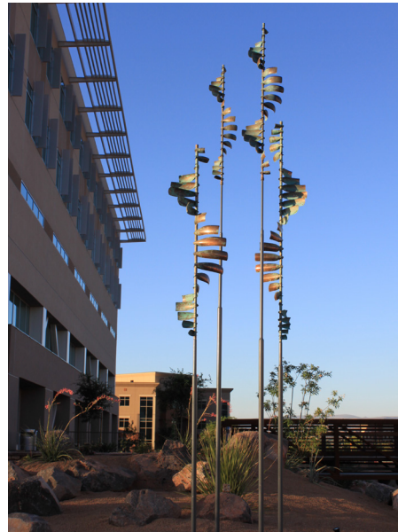
DRMC Health & Performance, St. George, UT.