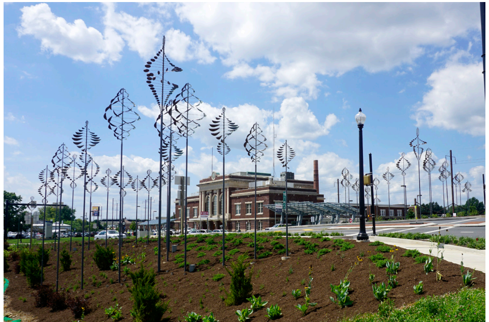
Lititz Pike Bridge, Lancaster, PA.

Indianola Parks, Indianola, IA. Three Sculptures (10-13 feet)